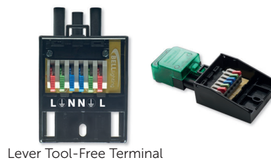
Lever Tool-Free Terminal